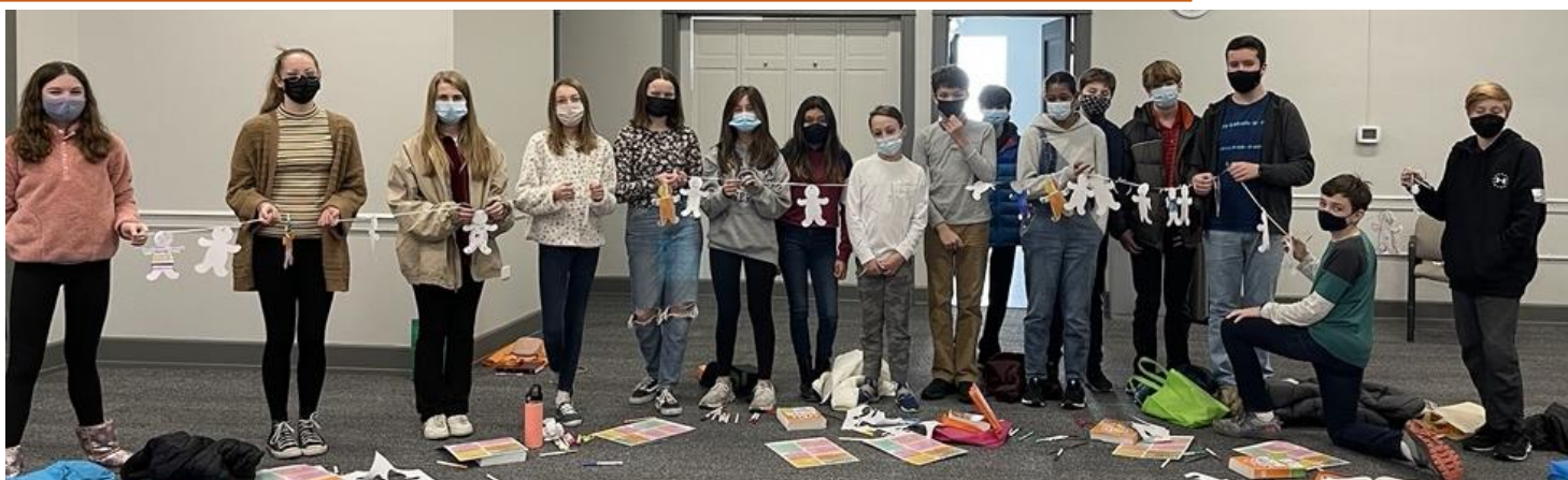
Our Confirmation Students joined together as the Body of Christ, sharing their gifts and how we live out our faith each day.

Annual reports are due to the office by January 10 th .